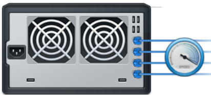
Figure 2) Superior Performance

Synology High Availability ensures seamless transition between clustered servers in the event of server failure with minimal impact to businesses.